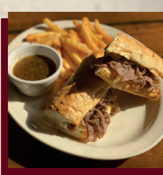
ITALIAN BEEF SANDWICH