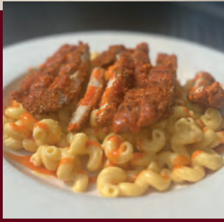
MAC N CHEESE

A combination of chocolate, pistachio, and cherry flavors with nuts and cherry bits throughout.