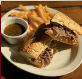
ITALIAN BEEF SANDWICH